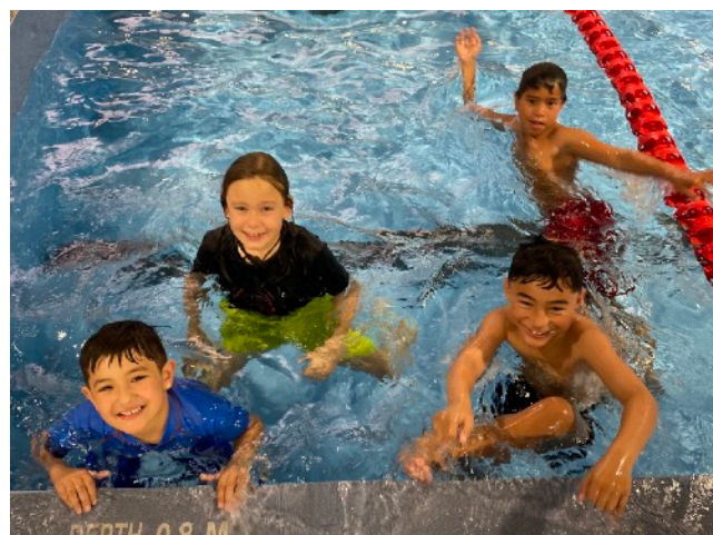
Swimming Fun - Week 3