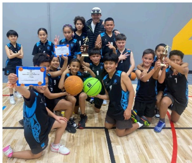
Our basketball winners from last Friday. Merivale Flyers and Tūtarawānanga Lakers, 2025 West Cluster Champions.