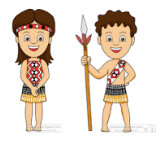
yay - Kapa Haka for the whole school this term.